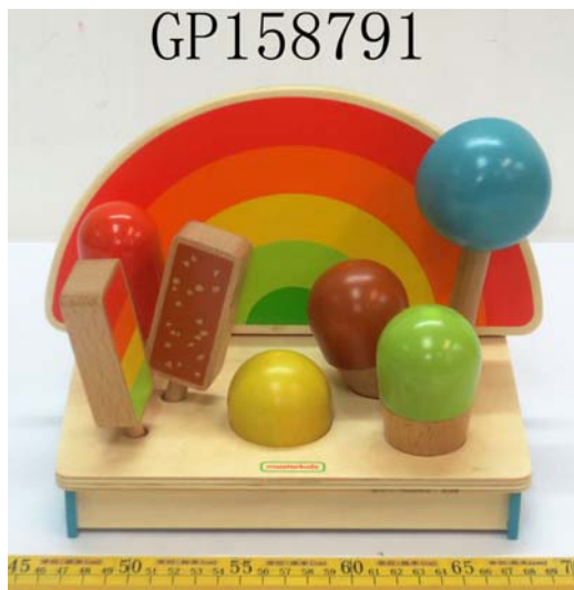
PHOTOGRAPH(S) OF THE SAMPLE